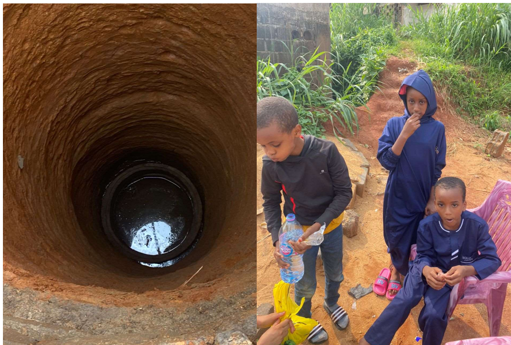
Current water Situation in the School

Additionally, the community is poorly equipped for any pandemic crisis, with a lack of knowledge and materials for being prepared, managing illnesses, and being ready for long-term food shortages.