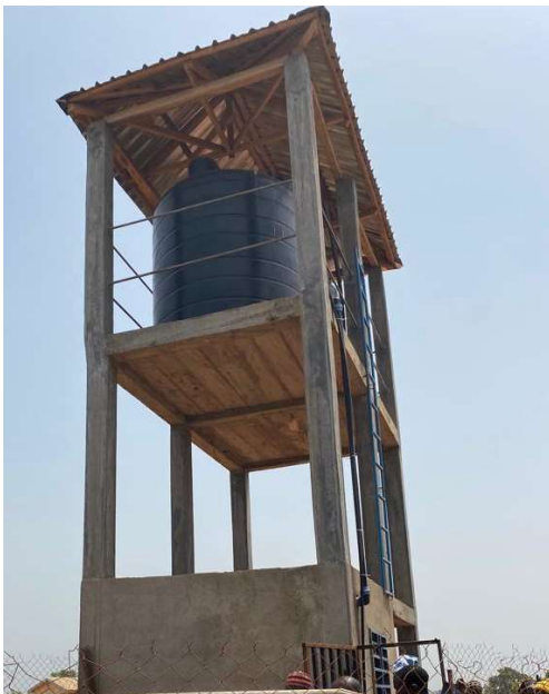
Construction of tower with and storage