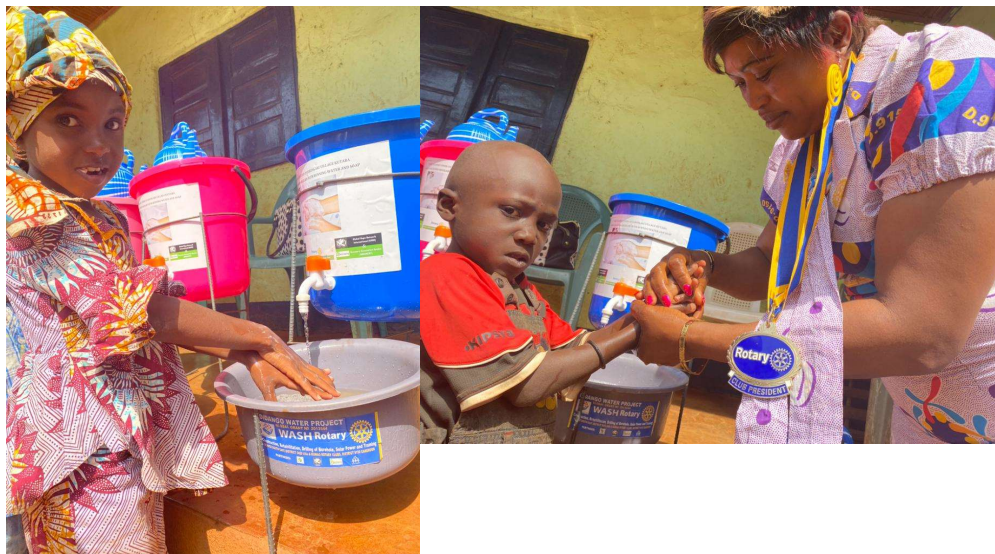
Provision of WASH trainings and Facilities