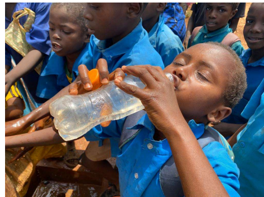
Provision of stand taps