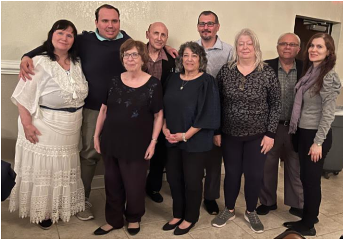
Italian Heritage Lodge