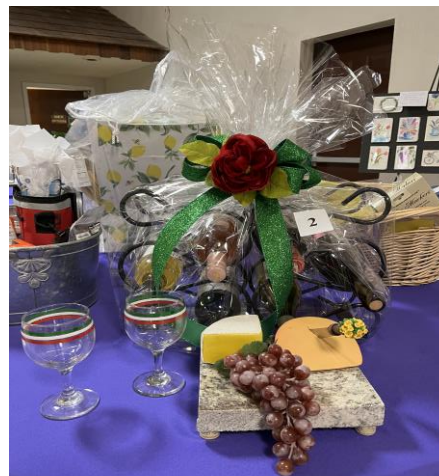
This is only one of our many impressive baskets and other creative and generous items donated by our local lodges for the auction.