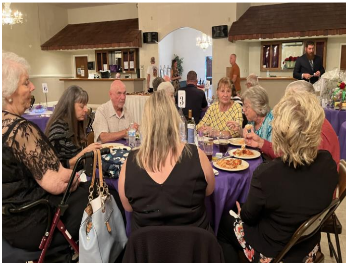
Giuseppe Verdi Lodge