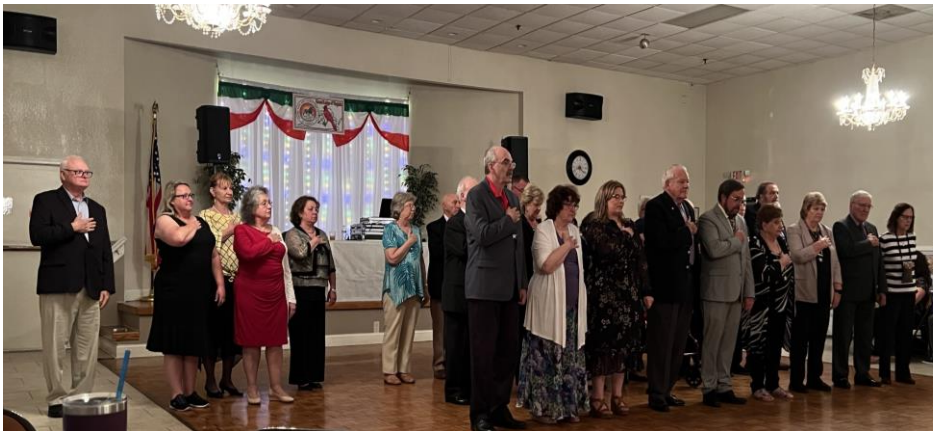
Newly installed officers take their oath of office.