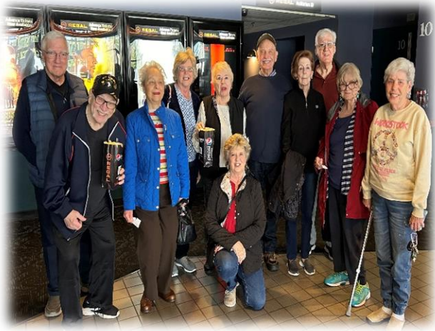
Outing to “Cabrimi” movie on opening day.