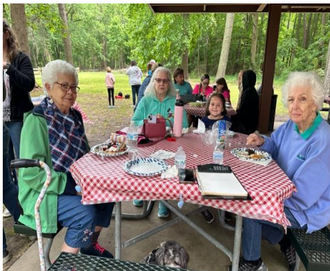
PIAL 2024 Annual Picnic