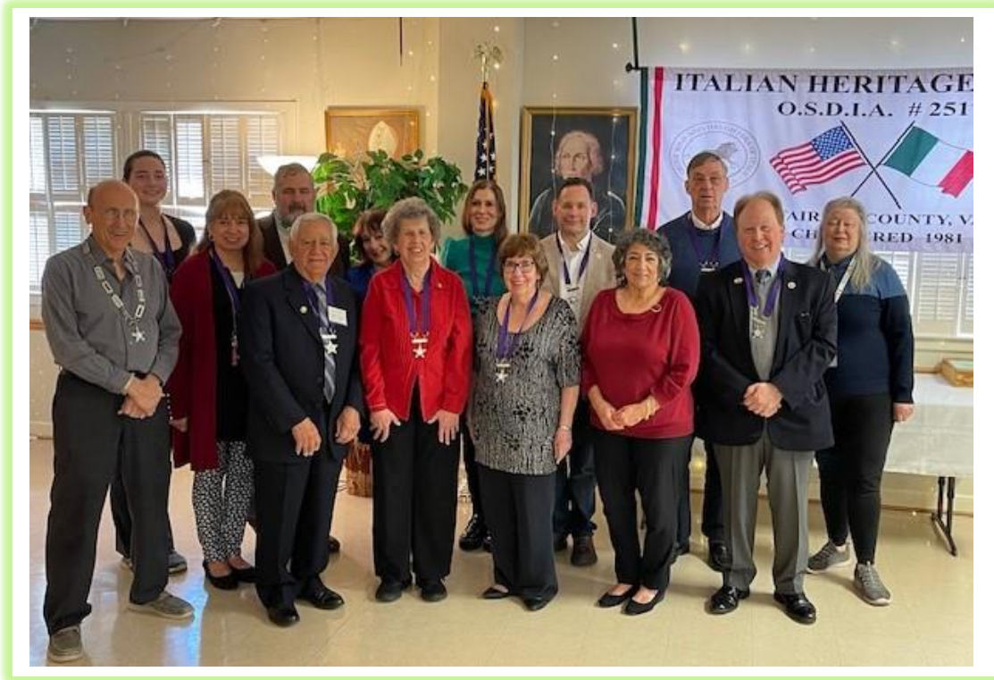
2024-2025 IHL Officers & Trustees

IHL proudly announces our incoming Officers and Trustees who have volunteered their time, talents, and efforts for the benefit of our lodge and our community at large. We congratulate them for this achievement and wish them “Buona Fortuna” in the coming year as we give them our assistance and dedication to our fraternal organization. We offer our gratitude and appreciation to our Executive Council members in their 2023-2024 term who made this past year successful and fun, while working so hard to bring amazing events to our members each month.