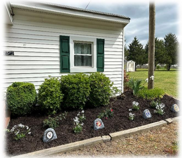
Military stones placed in Honor & Memory of GVL’s Veterans.