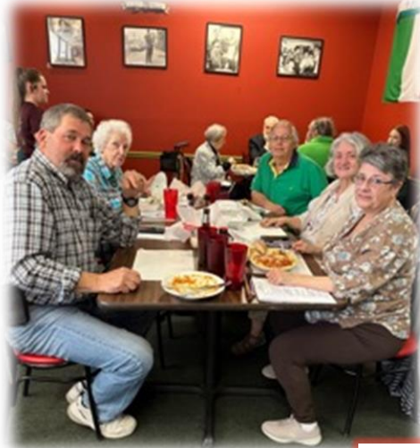
Our members and guests enjoy an Italian Meal before the installation.