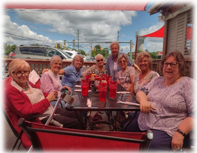
New Ladie’s group, The Rosetta’s, enjoying our first outing.