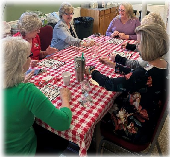
Playing cards after monthly meeting.