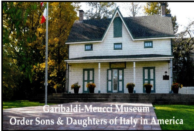
Garibaldi-Meucci Museum Order Sons & Daughters of Italy in America

Order Sons & Daughters of Italy in America Grand Lodge of California