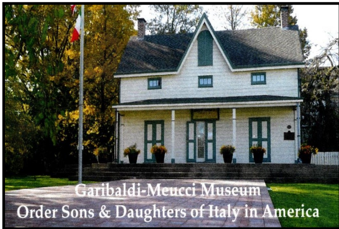
Garibaldi-Meucci Museum Order Sons & Daughters of Italy in America

Order Sons & Daughters of Italy in America Grand Lodge of California