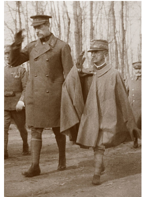
King Vittorio Emanuele III with King Albert I of Belgium, his son Umberto's father-in-law

The flight to Brindisi (under Anglo-American tutelage) and the abandonment of the capital in the hands of the Germans the day after the announcement of the armistice was the tombstone on his image. Pro-monarchists argue that this was a necessary transfer to save the continuity of the state. The fact remains that, with that choice, the king first of all saved his own skin. The escape, together with the "conspiracy of silence" of the following days, had disastrous effects: it gave the Germans time to organize themselves, take control of central-northern Italy and free Mussolini. Exposing the country to an additional 20 months of war. All this was fatal for the fate of the monarchy in Italy.