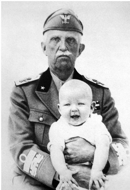
King Vittorio Emanuele III and his grandson Vittorio Emanuele (IV)

Who really was this monarch who handed the nation over to the fascists and sealed the fate