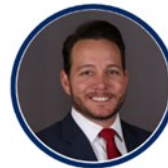
Paul Bonaros Investments