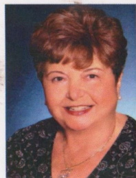
Member of Who's Who in Luxury Real Estate™