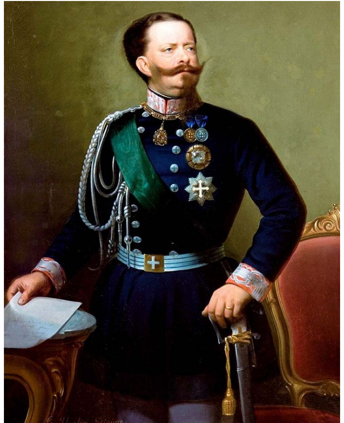
King Victor Emmanuel II

Moving to the Quirinal Palace, he led a life far from the excesses of worldly life. He died of a fever following a hunting trip in 1878. A lover of hunting but delicate of lungs, he spent a night outdoors in the swampy areas of the lake in his Lazio hunting estate. The humidity of that environment proved fatal to him. The King died after almost 29 years of reign.