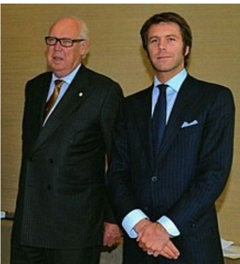
Vittorio Emanuele (IV) with his son Emanuele Filiberto

Unfortunately, the Savoy family had been exiled from Italy since 1946 when Italians voted to abolish the monarchy after WWII, punishing the family for first collaborating with fascist dictator Mussolini and then fleeing Rome in 1944 to avoid an invading German army.